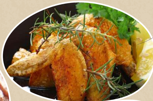
Tosa Hachikin Jidori chicken