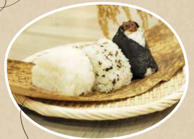
Onigiri (rice balls) made with Tosa Tenku no Sato rice