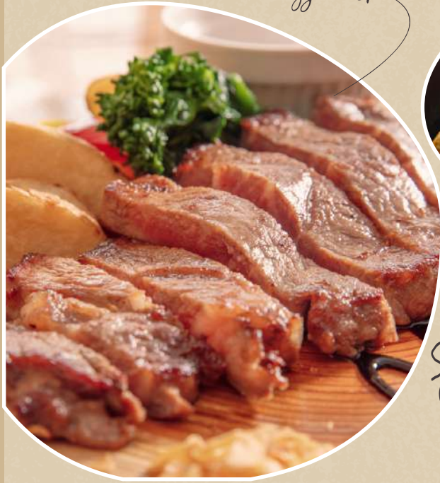
Tosa Akaushi Wagyu beef

Savor the rare and flavorful Tosa Akaushi beef—known for its lean, healthy richness—rice from picturesque terraced fields, sake brewed from it, and a colorful variety of local vegetables. Every bite tells the story of the land.