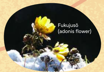
Fukujusō (adonis flower)

Tosa Reihoku's scenery gently changes with each season—from the soft greens of spring to the deep hues of autumn. Surrounded by mountains, rivers, and tranquil countryside, visitors can slow down and feel the rhythm of nature, spending time that soothes both body and soul.